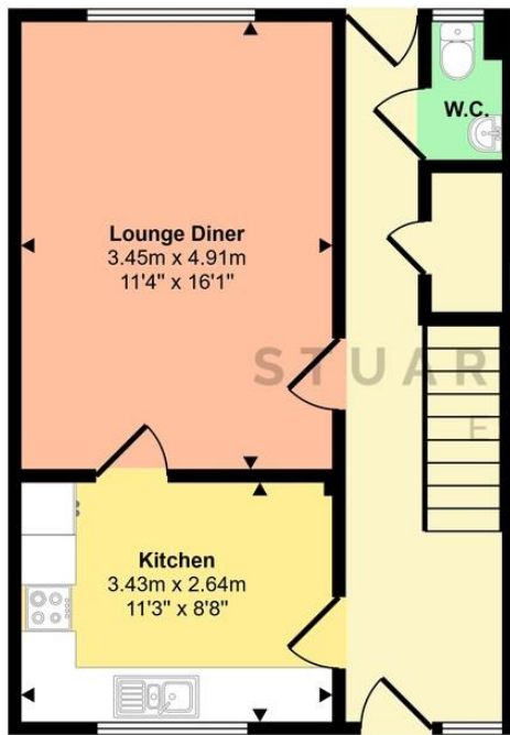
Ground Floor Approx 41 sq m / 441 sq ft

Approx Gross Internal Area 83 sq m / 895 sq ft