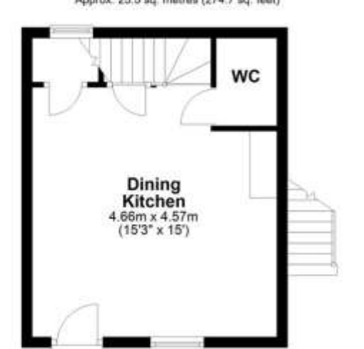
Ground Floor Approx. 25.5 sq. metres (274.7 sq. feet)