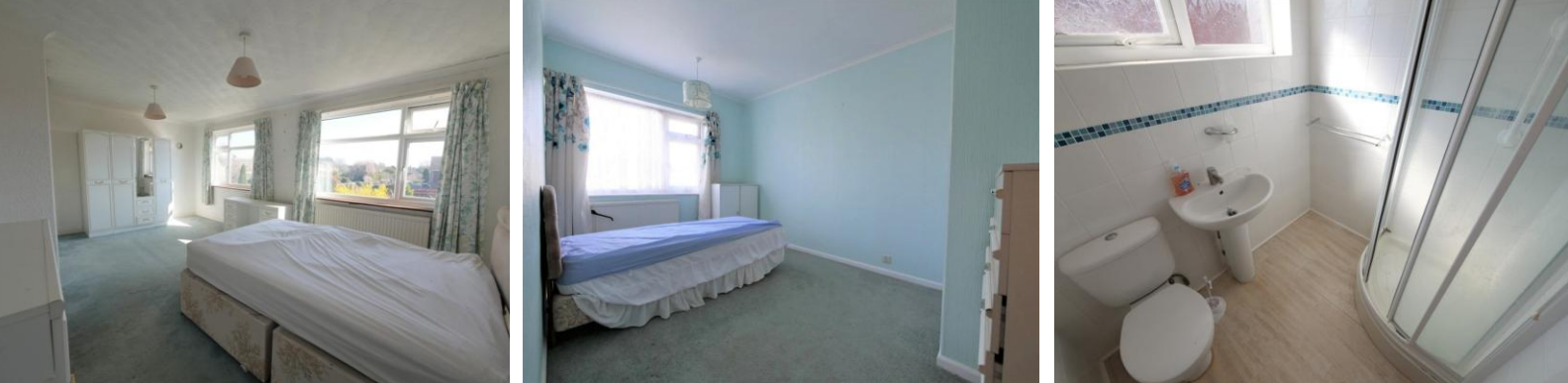
Larchcroft Road, Ipswich, IP1 6PQ