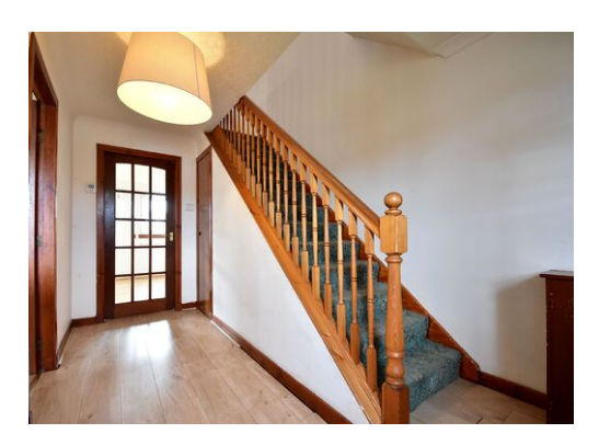
40 Brodie Place Elgin Moray IV30 4LP