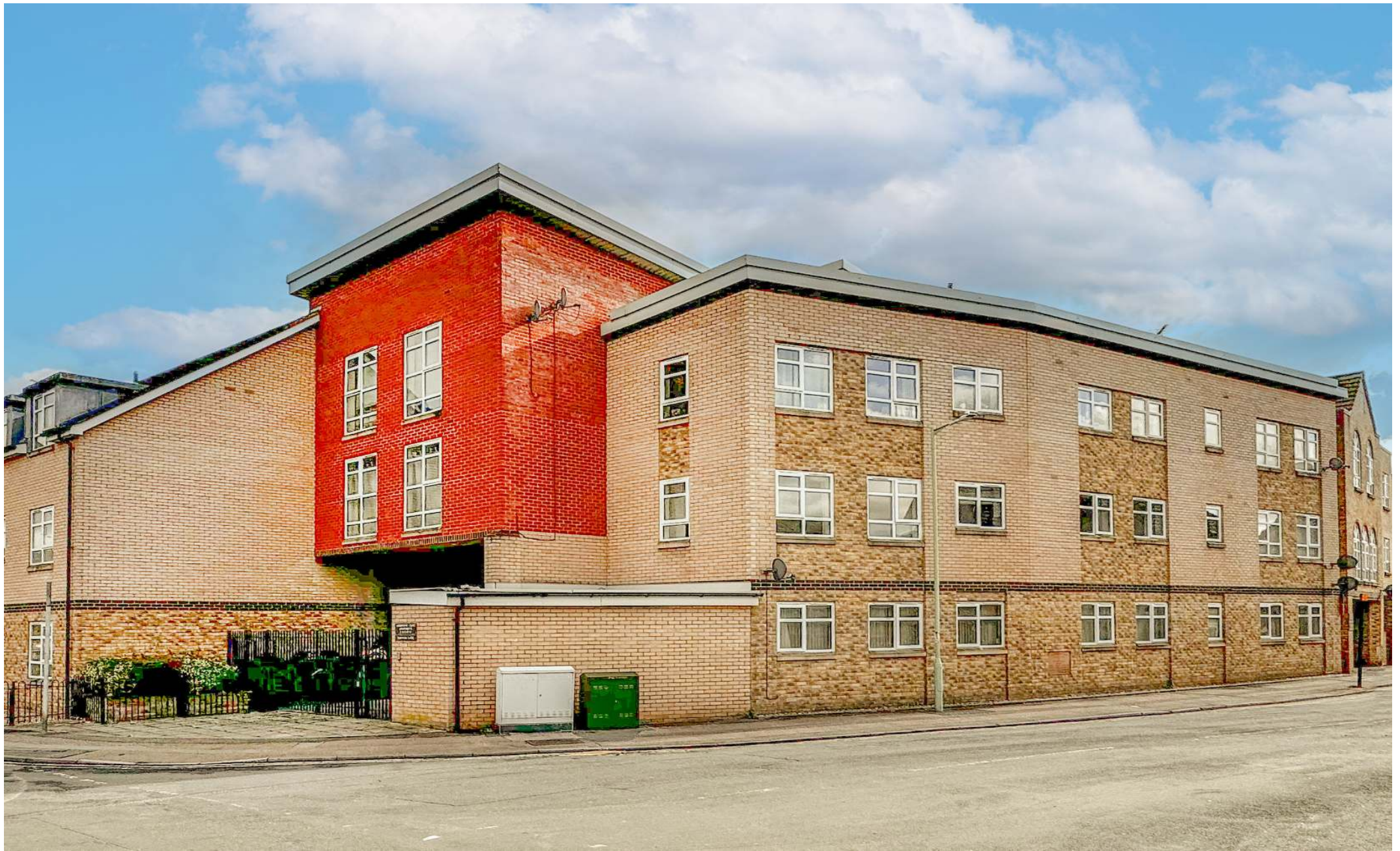
Ashbourne Court, All Saints Road, Newmarket