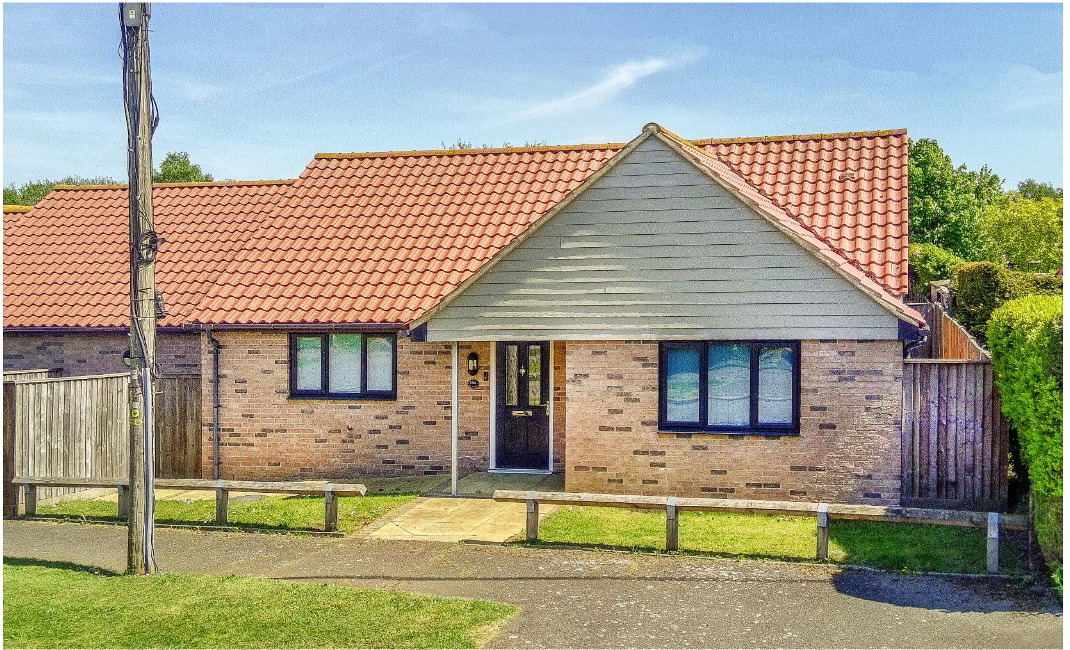
The Avenue, Risby, Bury St. Edmunds, Suffolk