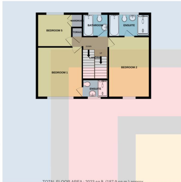
1ST FLOOR 617 sq.ft. (57.3 sq.m.) approx.