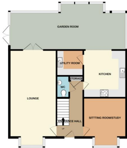
GROUND FLOOR 936 sq.ft. (87.0 sq.m.) approx.