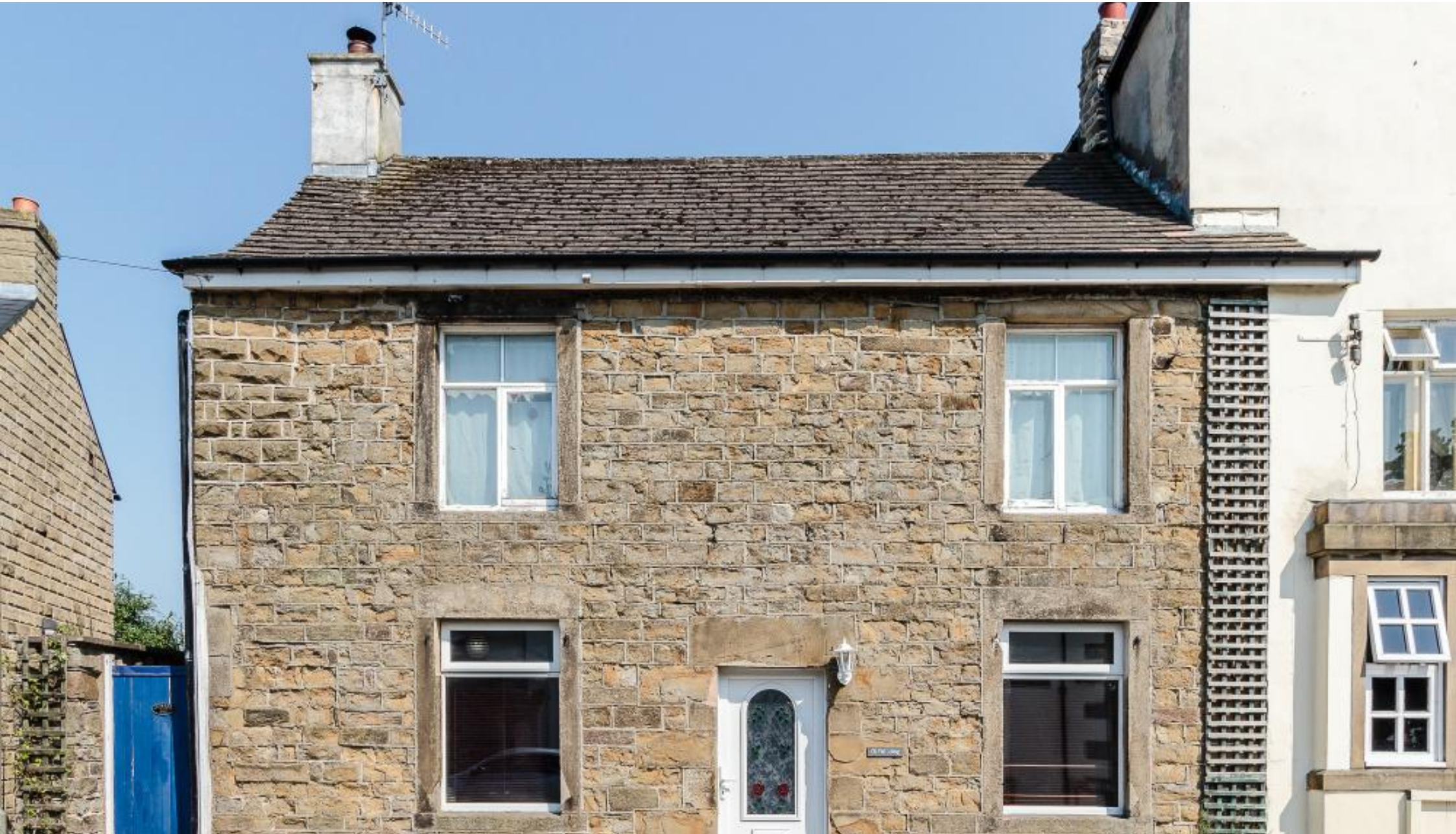
Old Hall Cottage, Edale Road, Hope, Hope Valley, Derbyshire, S33 6ZF