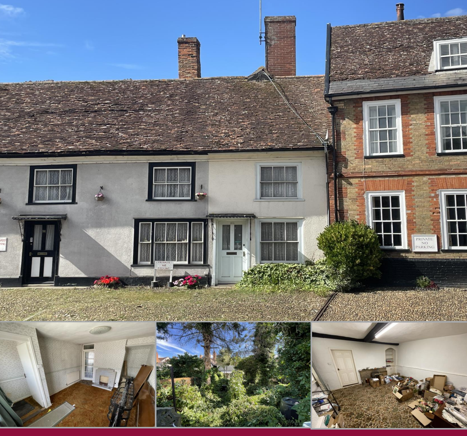
91a High Street | Needham Market | Suffolk | IP6 8DQ

Specialist marketing for | Barns | Cottages | Period Properties | Executive Homes | Town Houses | Village Homes