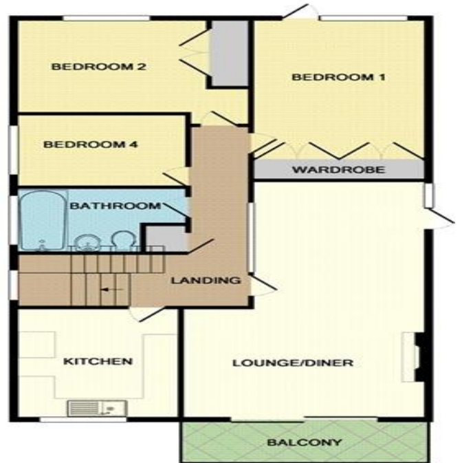
1ST FLOOR APPROX. FLOOR AREA 855 SQ.FT. (79.4 SQ.M.)

TOTAL APPROX. FLOOR AREA 1331 SQ.FT. (123.7 SQ.M.)