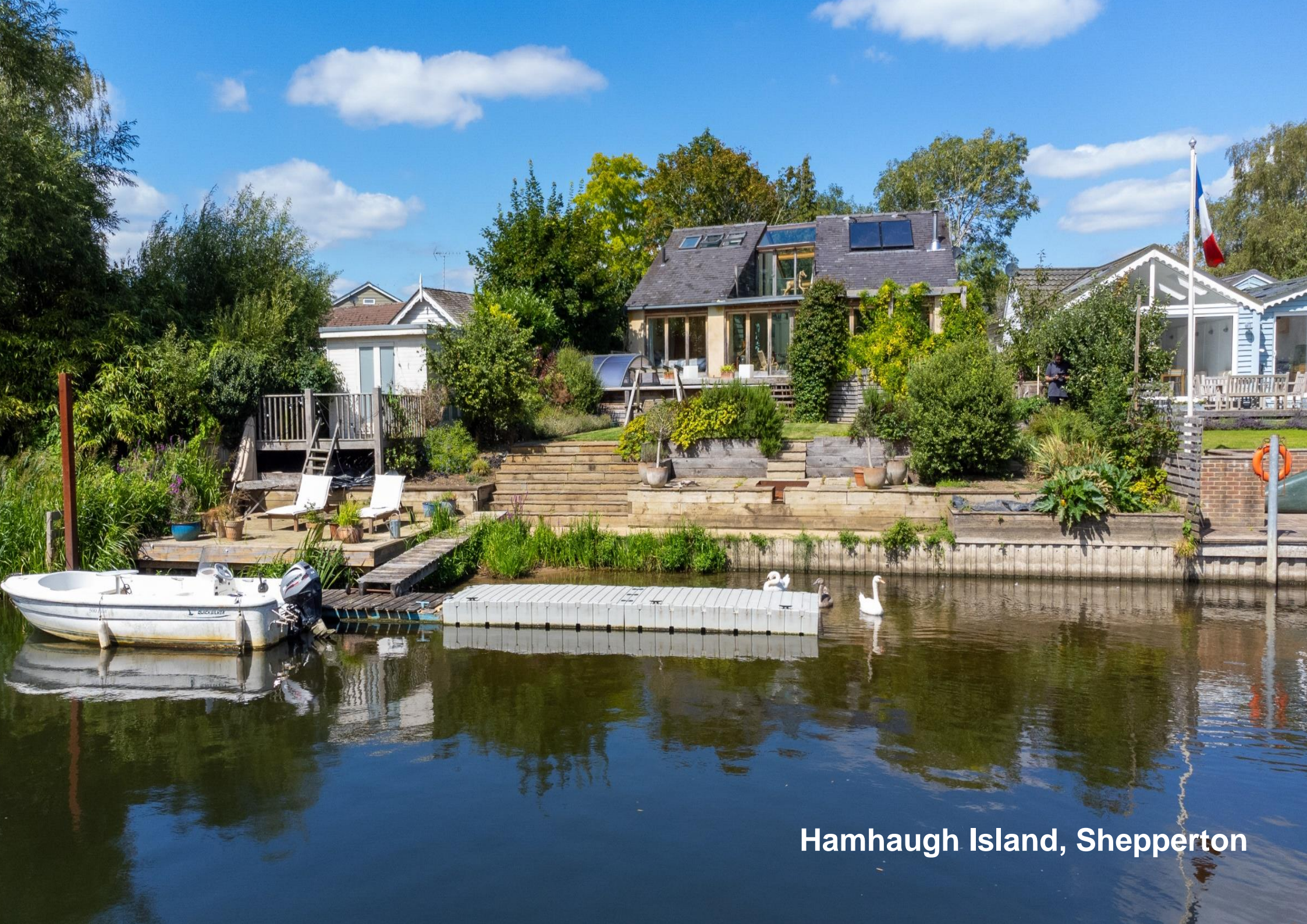
Hamhaugh Island, Shepperton