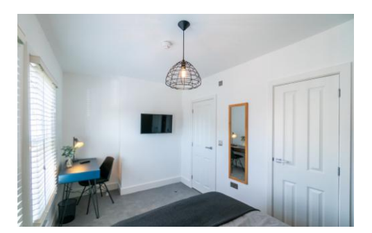
52 Star RoadCaversham, Reading, Berkshire, RG4 5BG