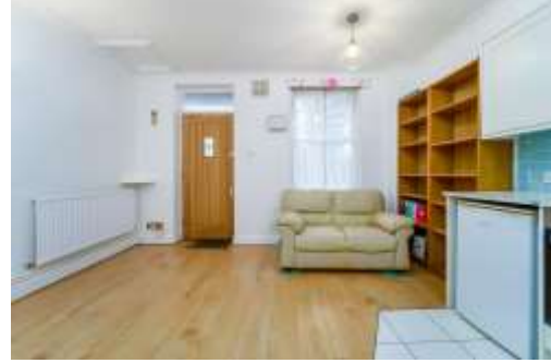
Flat 4 Bakers Court, High Street, Stanwell Village, Surrey TW19 7JS £200,000 - Leasehold

SJ Smith are pleased to present to the market this fantastic one bedroom ground floor maisonette in the heart of Stanwell Village. The property has been completely refurbished and is being sold with No Onward Chain!