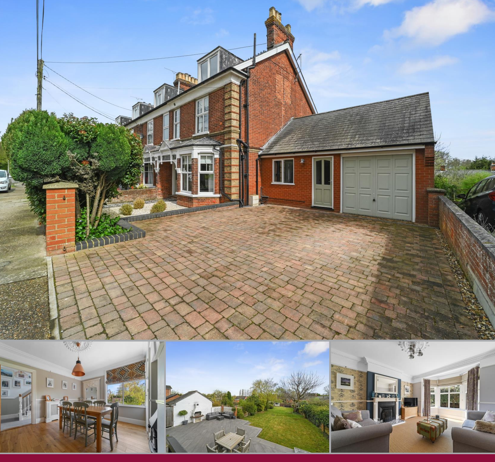
Fernside | 66 Stowmarket Road | Needham Market | Suffolk | IP6 8DX

Specialist marketing for | Barns | Cottages | Period Properties | Executive Homes | Town Houses | Village Homes