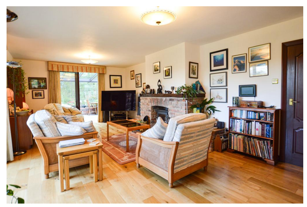
The Gazebo Old Hall Road, Batley,