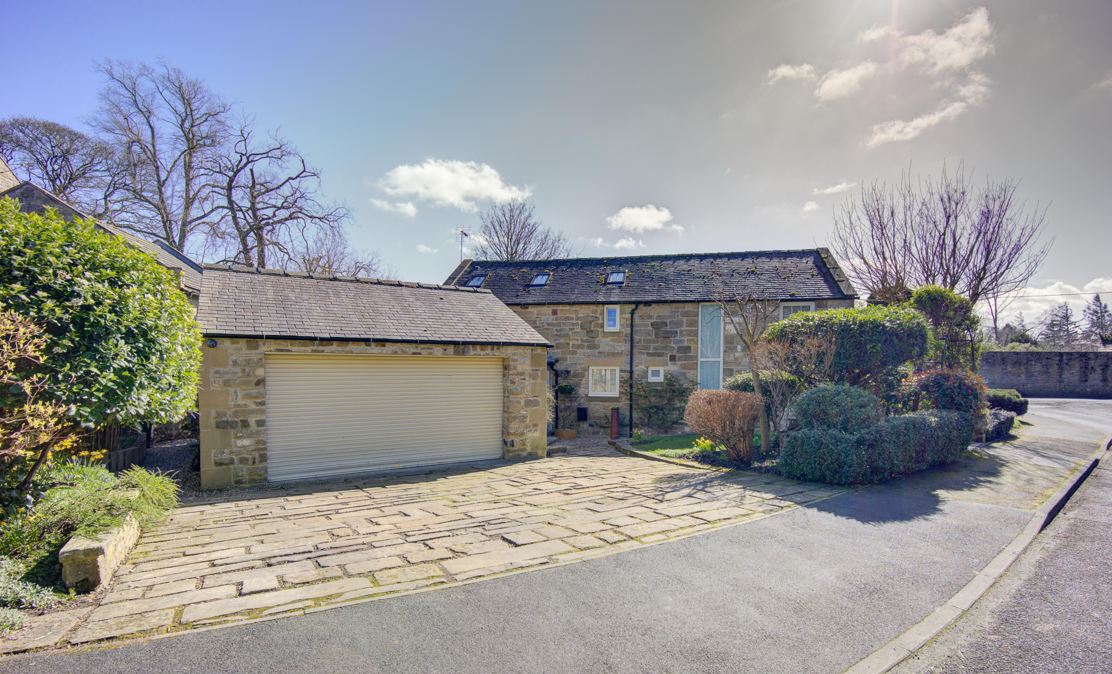
The Coach House, Main Street Acomb, Hexham, NE46 4PL