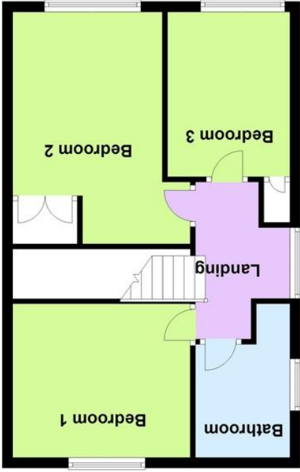
First Floor Approx. 492.8 sq. feet