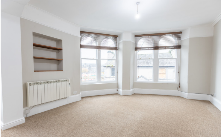
Open Plan Living Room & Kitchen