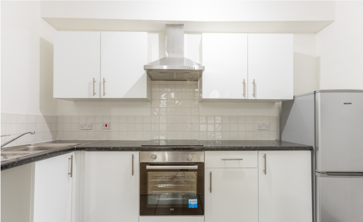
Open Plan Living Room & Kitchen