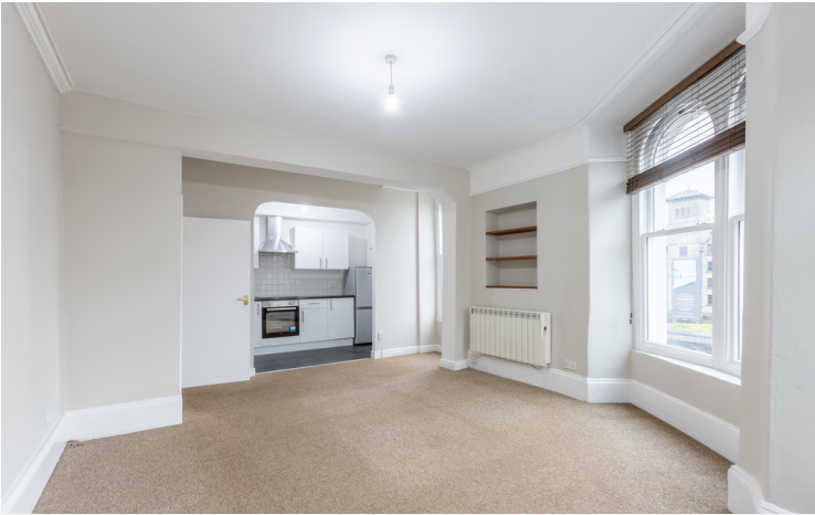
Open Plan Living Room & Kitchen