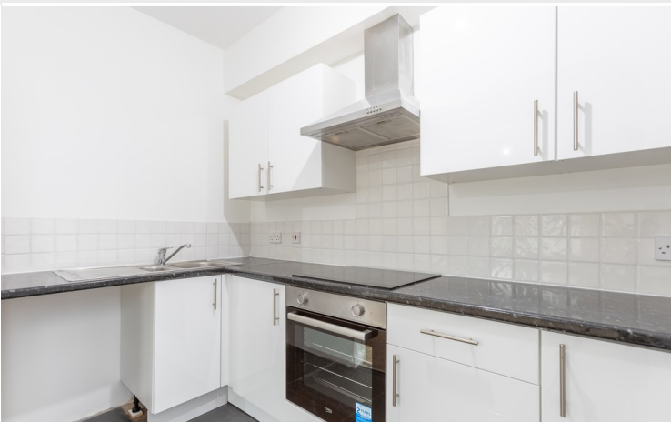
Open Plan Living Room & Kitchen