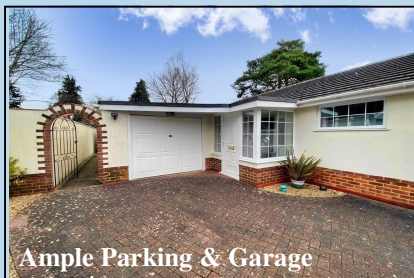
Ample Parking & Garage

IMPORTANT NOTE: These particulars are believed to be correct but their accuracy is not guaranteed. They do not form part of any contract. Nothing in these particulars shall be deemed to be a statement that the property is in good structural condition or otherwise, nor that any of the services, appliances, equipment or facilities are in good working order or have been tested. Purchasers should satisfy themselves on such matters prior to purchase.