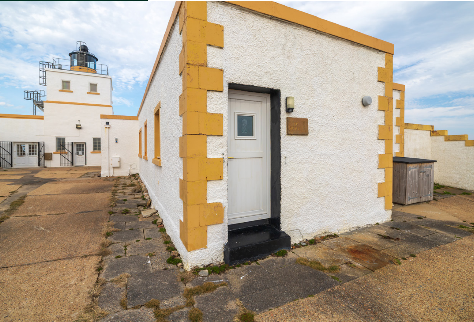
CHARMING COASTAL BOTHY AT STRATHY LIGHTHOUSE

STRATHY POINT LIGHTHOUSE, STRATHY, CAITHNESS, KW14 7RY