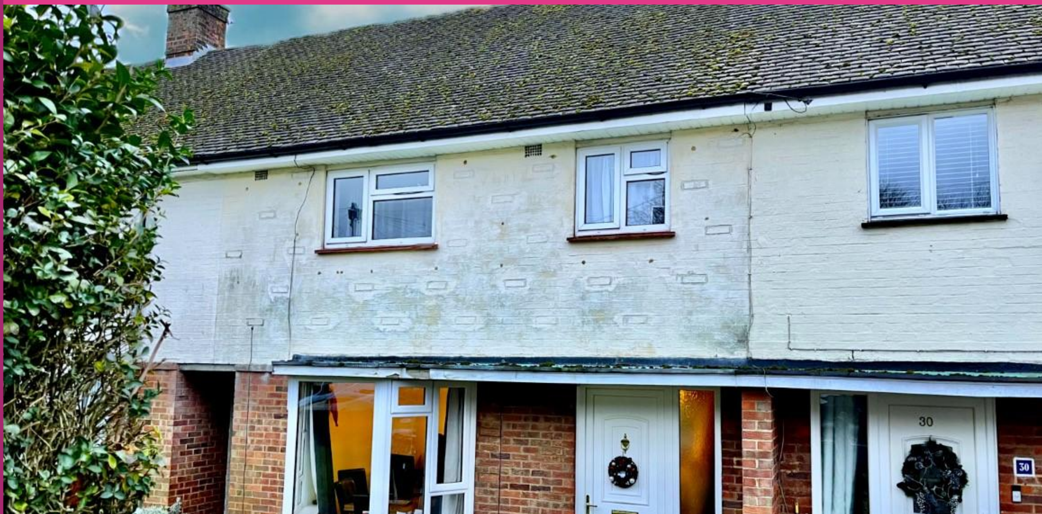
THE BROW, WATFORD - OIEO £390,000 3 Bedroom Mid Terraced House