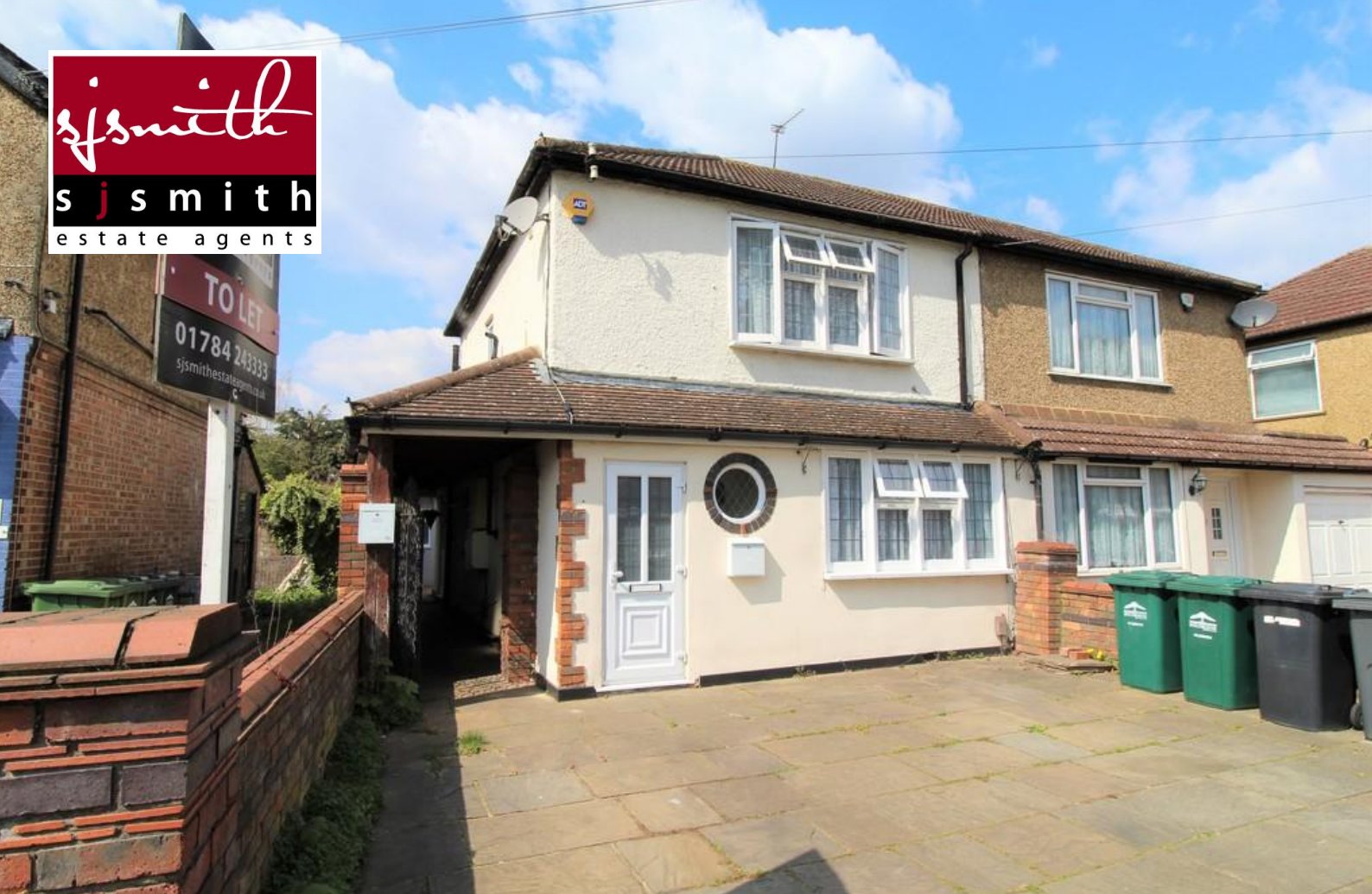
ANNEX, 4 LONG LANE, STAINES-UPON-THAMES, TW19 7AA £1,575 PCM