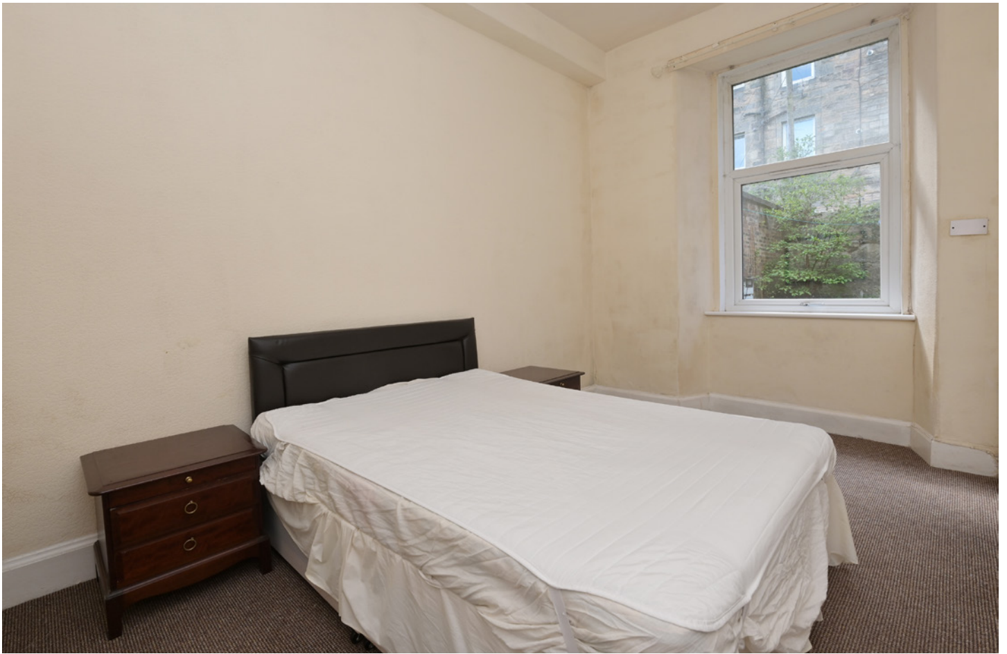
The generous double bedroom provides excellent space for furniture and storage, making it a comfortable retreat. A well-sized bathroom completes the accommodation, fitted with a white suite.