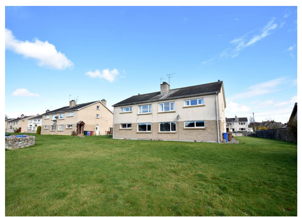
Fixed Price £130,000

Located within the sought after West End area of Elgin, is this 2 Bedroom 1st Floor Flat which benefits from its Own Rear Garden and Garage.