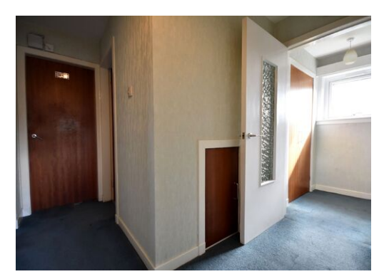
53 Fleurs Road Elgin Morayshire IV30 1TA