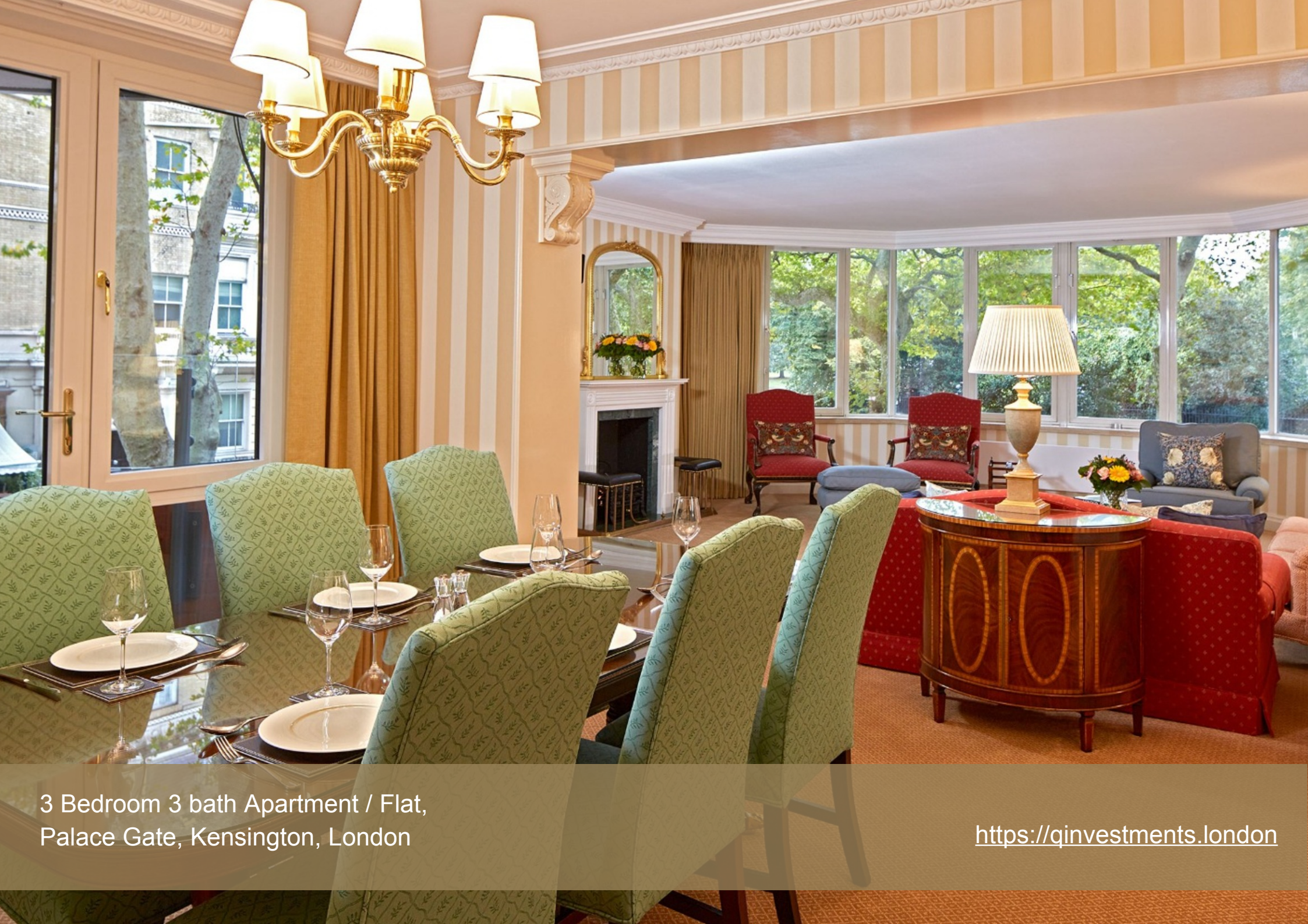
3 Bedroom 3 bath Apartment / Flat, Palace Gate, Kensington, London