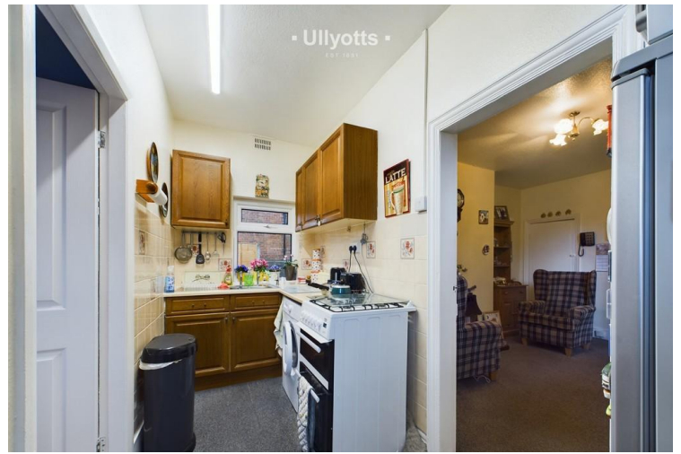
Flat 1 Kitchen