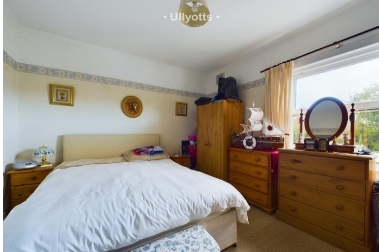
Flat 2 Bedroom