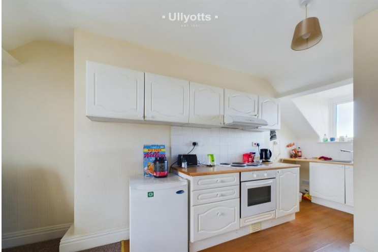
Flat 3 Kitchen