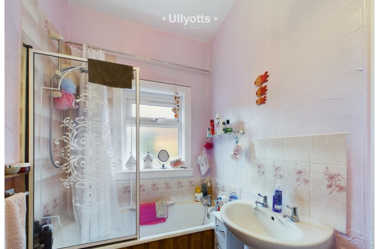
Flat 1 Bathroom