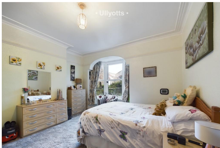
Flat 1 Bedroom