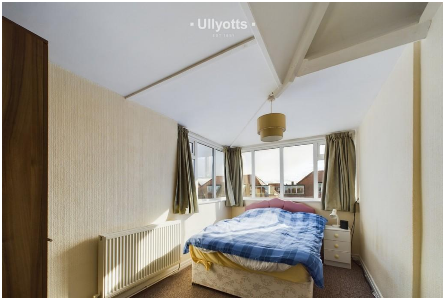
Flat 3 Bedroom