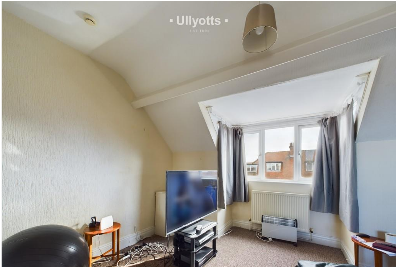
Flat 3 Lounge