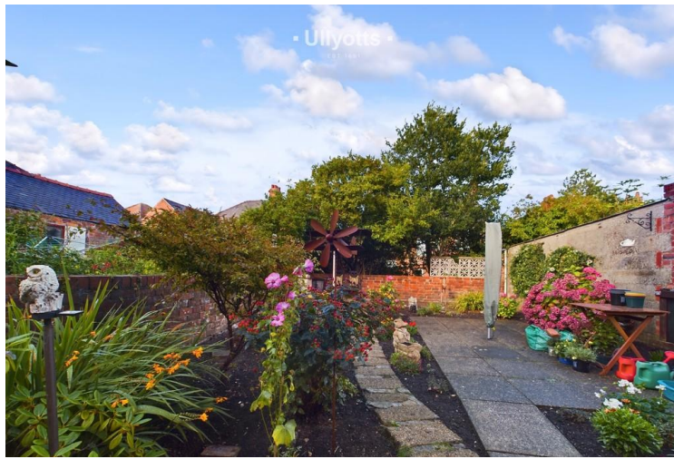
Flat 1 Garden