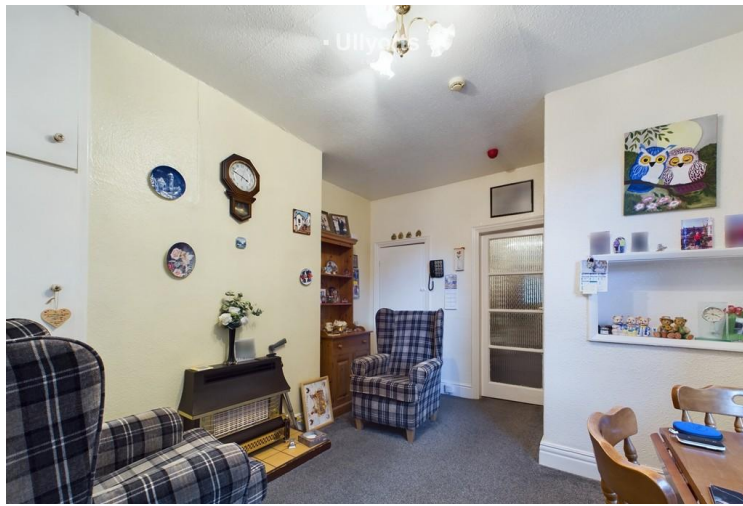
Flat 1 Sitting room