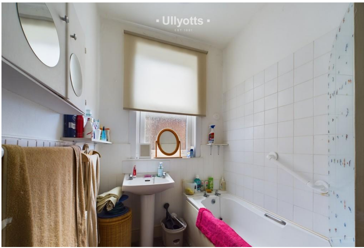
Flat 2 Bathroom