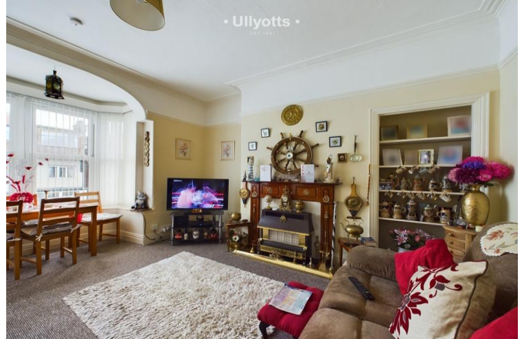
Flat 2 Lounge