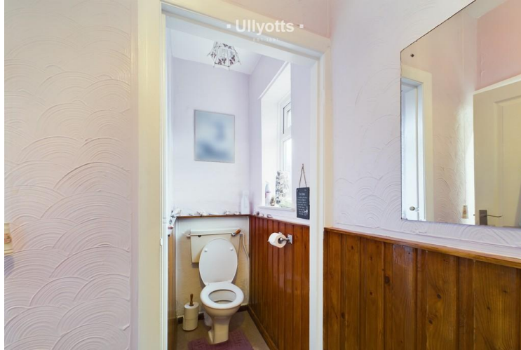
flat 1 wc