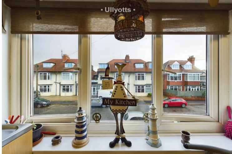
Flat 2 view