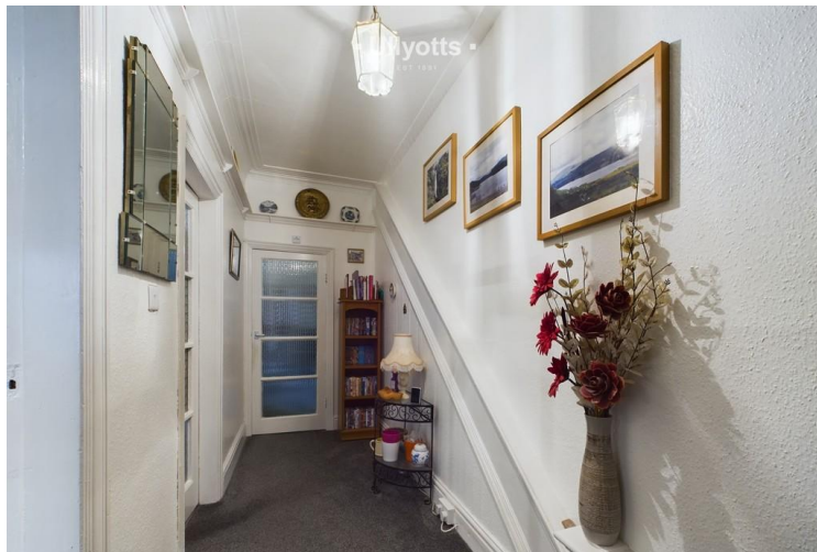
Flat 1 Entrance