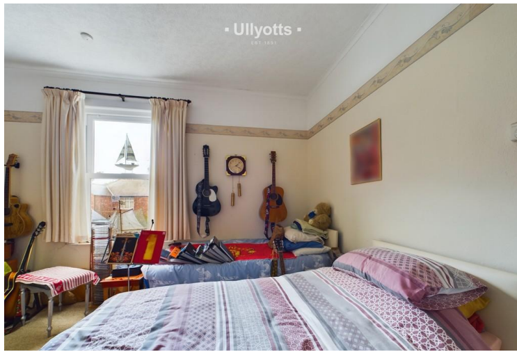
Flat 2 Bedroom