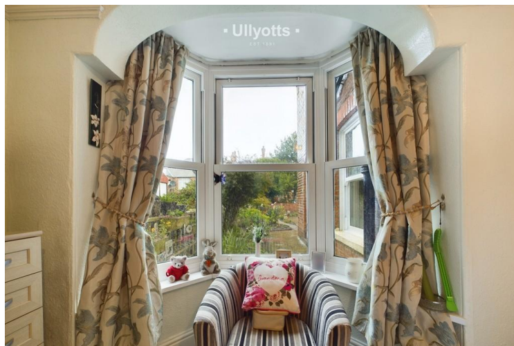
Flat 1 Bedroom