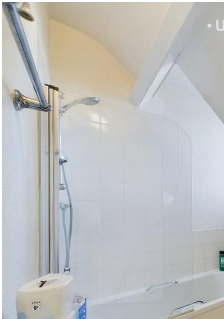
Flat 3 Bathroom