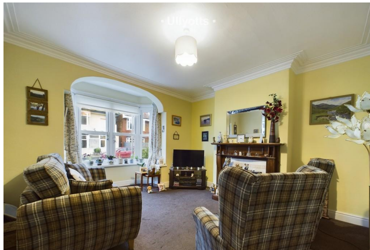
Flat 1 Lounge