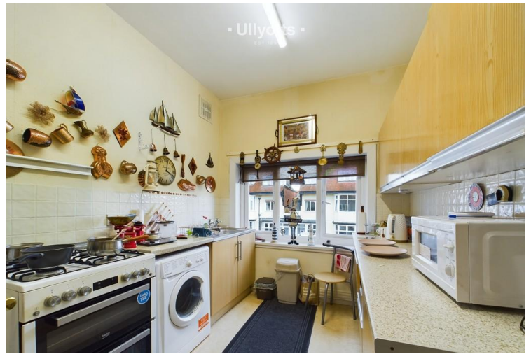
Flat 2 Kitchen