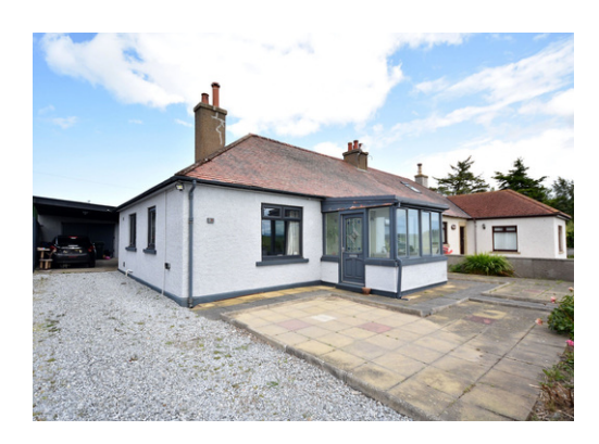
3 County Houses Lochhills, Elgin Morayshire IV30 8LS