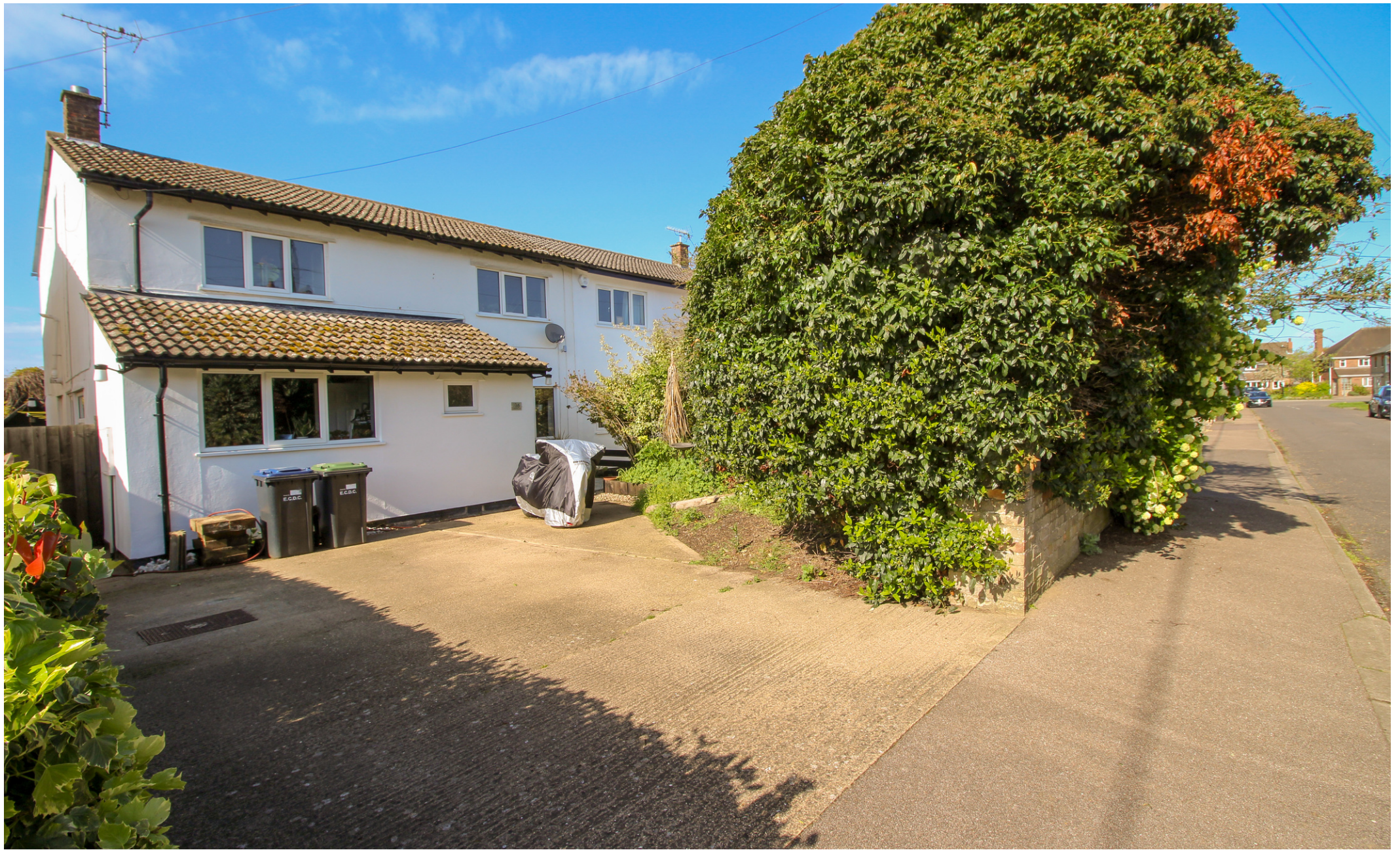
Mill Road, Lode, Cambridge