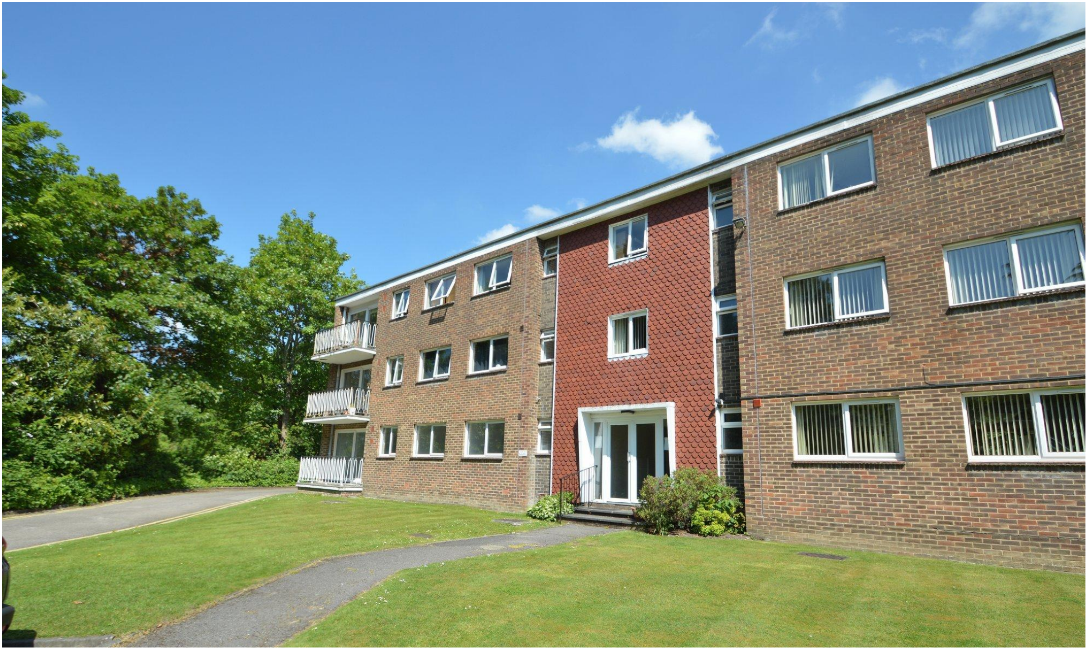
Boston Court, 55 Brownhill Road, Chandler's Ford, SO53 2EH