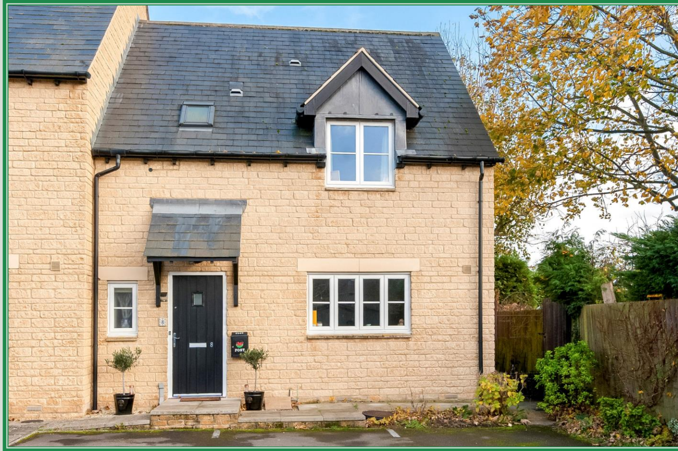
Middle Barton Oxfordshire