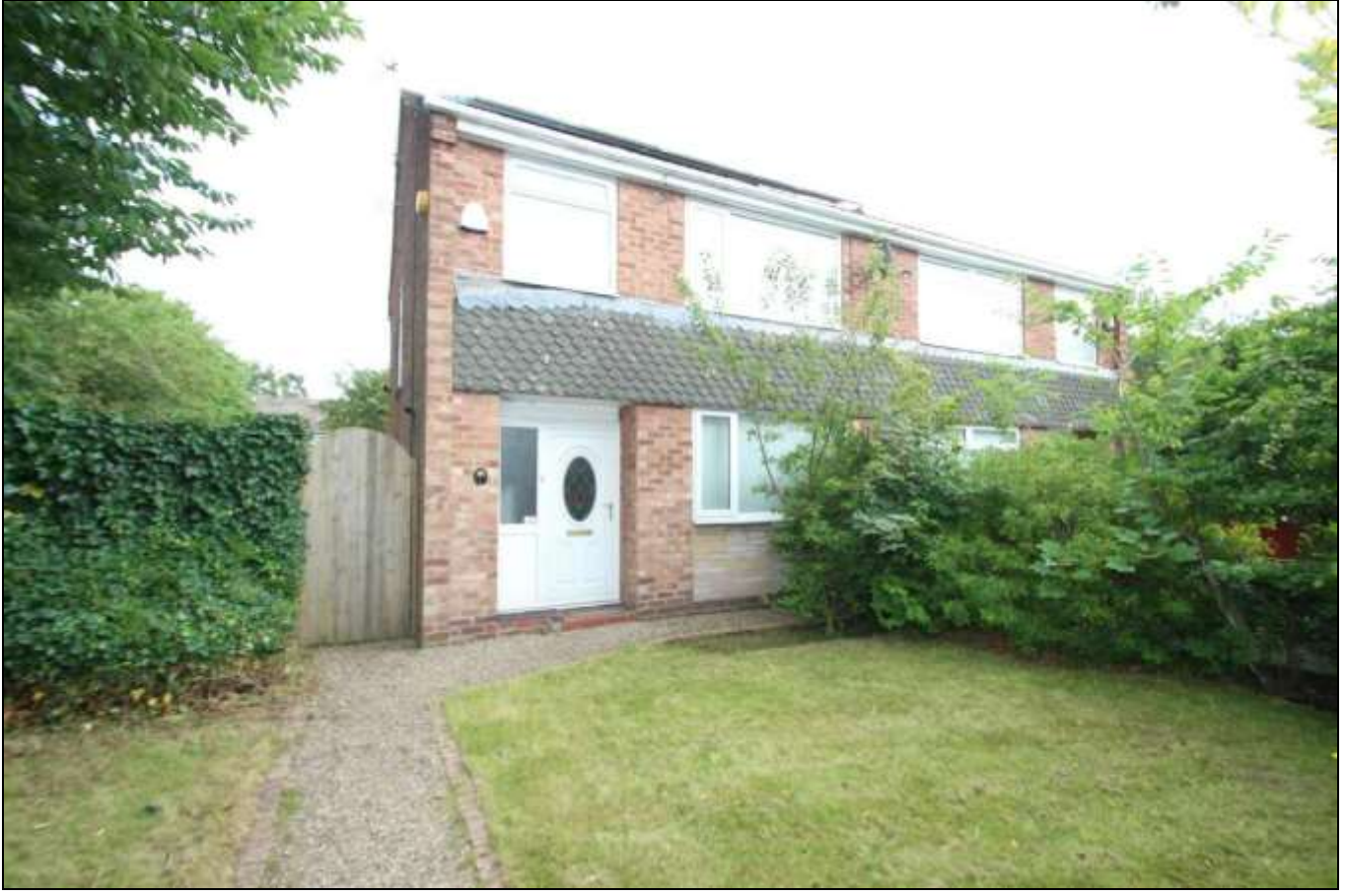
GARDEN AND DOUBLE GARAGE IDEALLY LOCATED FOR SCHOOLS AND METROLINK. 924sqft.

Hall. Living/Dining Room. Conservatory. Kitchen. Three Bedrooms. Bathroom. Driveway. Garage. Gardens. No Chain.