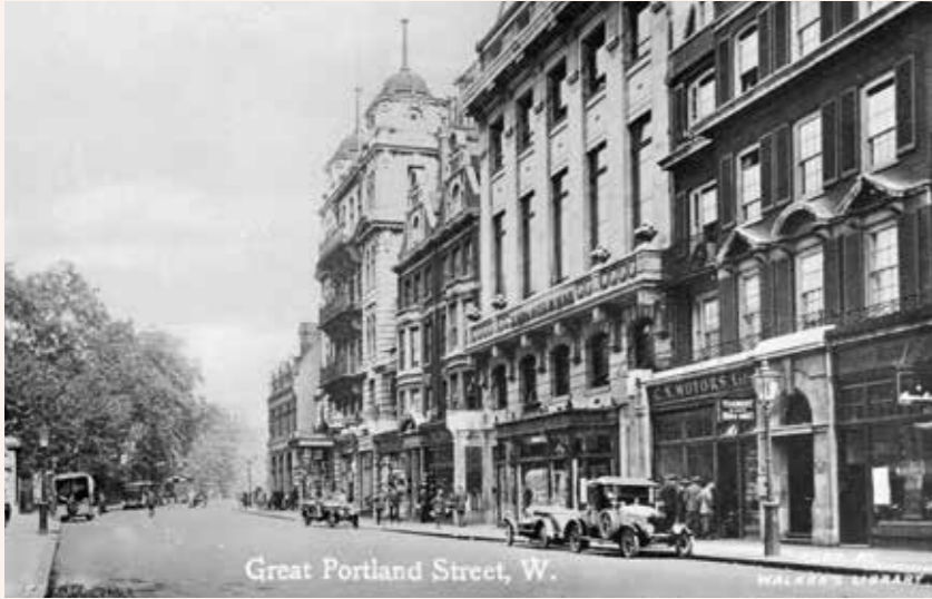
WHEEL OF TIME From 'Motor Row' to textile hub, Great Portland Street has an exciting and storied past.