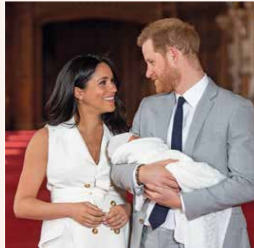
ARCHIE MOUNTBATTEN-WINDSOR BRITISH ROYAL FAMILY The seventh in line to the British throne was born at the Portland Hospital on Great Portland Street, adding to the list of notable births, both Royal and celebrity, that the hospital is famous for.