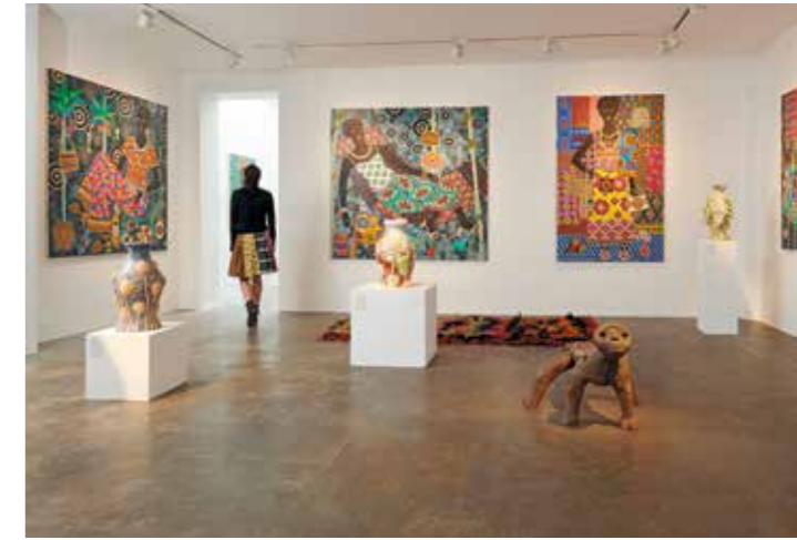
Rebecca Hossack Art Gallery

Explore the galleries, boutiques and hideaways for that special something.