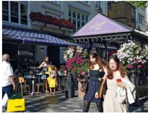
St Christopher's Place

RETAIL THERAPY Shop global brands, designer labels or independent retailers, all just a stroll away.