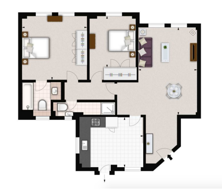
ILLUSTRATION FOR IDENTIFICATION PURPOSES ONLY. NOT TO SCALE * As Defined by RICS - Code of Measuring Practice

APPROX. GROSS INTERNAL AREA * 860 Ft<sup>2</sup> - 79.89 M<sup>2</sup>