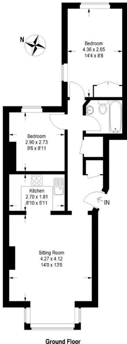
Illustration for identification purposes only, measurements are approximate, not to scale. Imageplansurveys @ 2022

Approximate Gross Internal Area 57.8 sq m / 622 sq ft