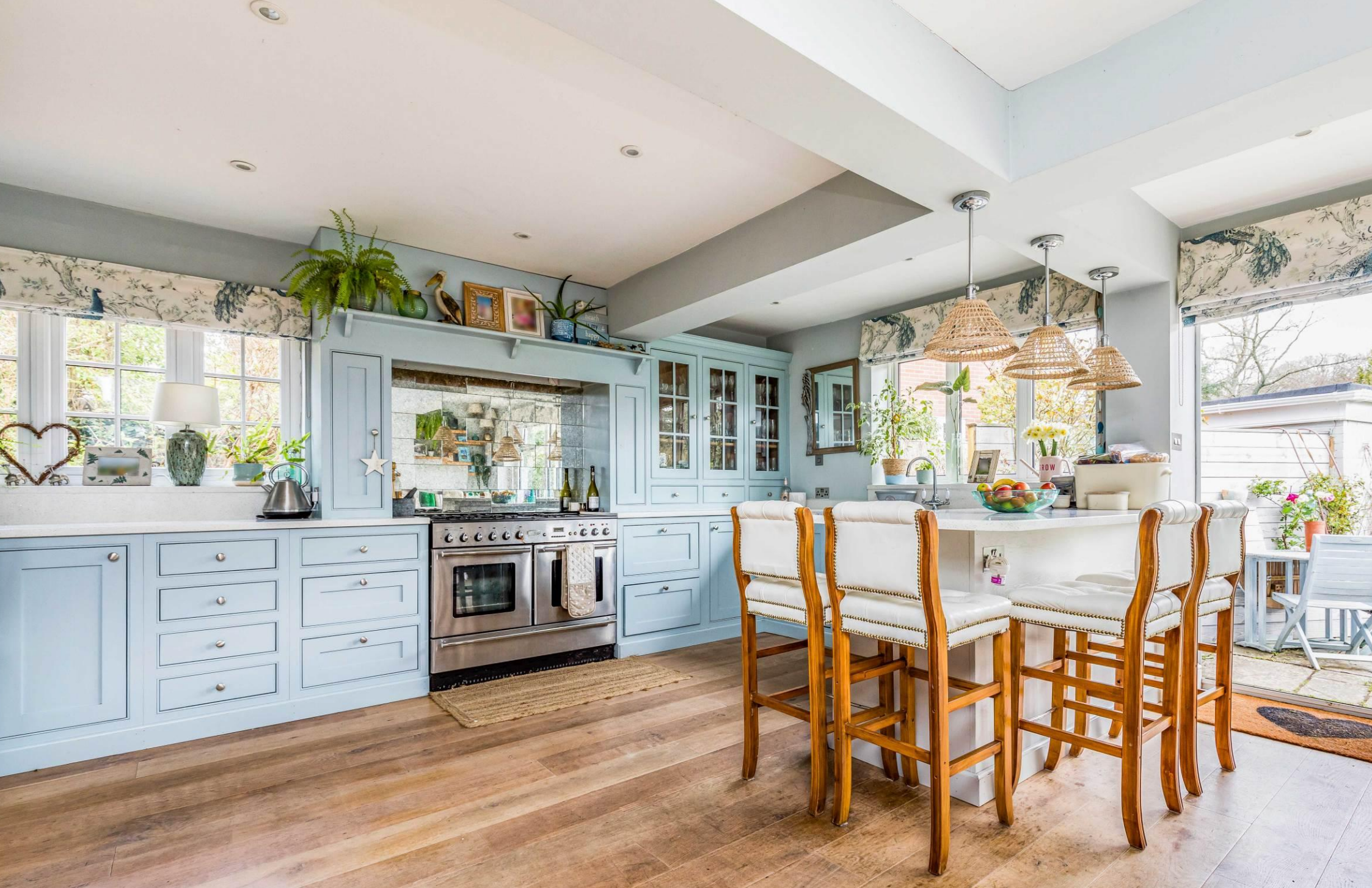
Tangle Trees, Pine Grove, West Broyle, Chichester, PO19 3PN