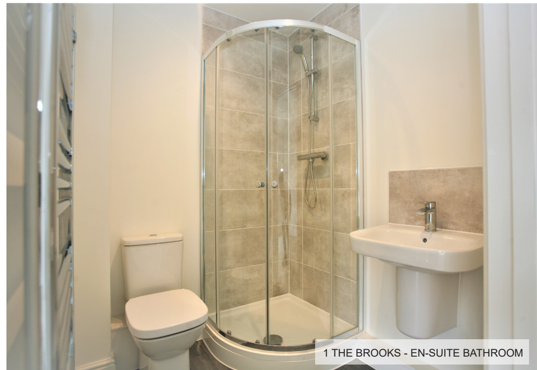
1 THE BROOKS - EN-SUITE BATHROOM