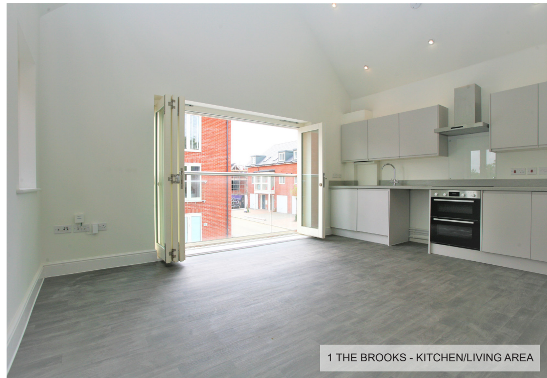
1 THE BROOKS - KITCHEN/LIVING AREA

Let to a private individual on an Assured Shorthold Tenancy (AST), expiring 24 Jul 2023 (holding over) at £675pcm (£8,100pa).