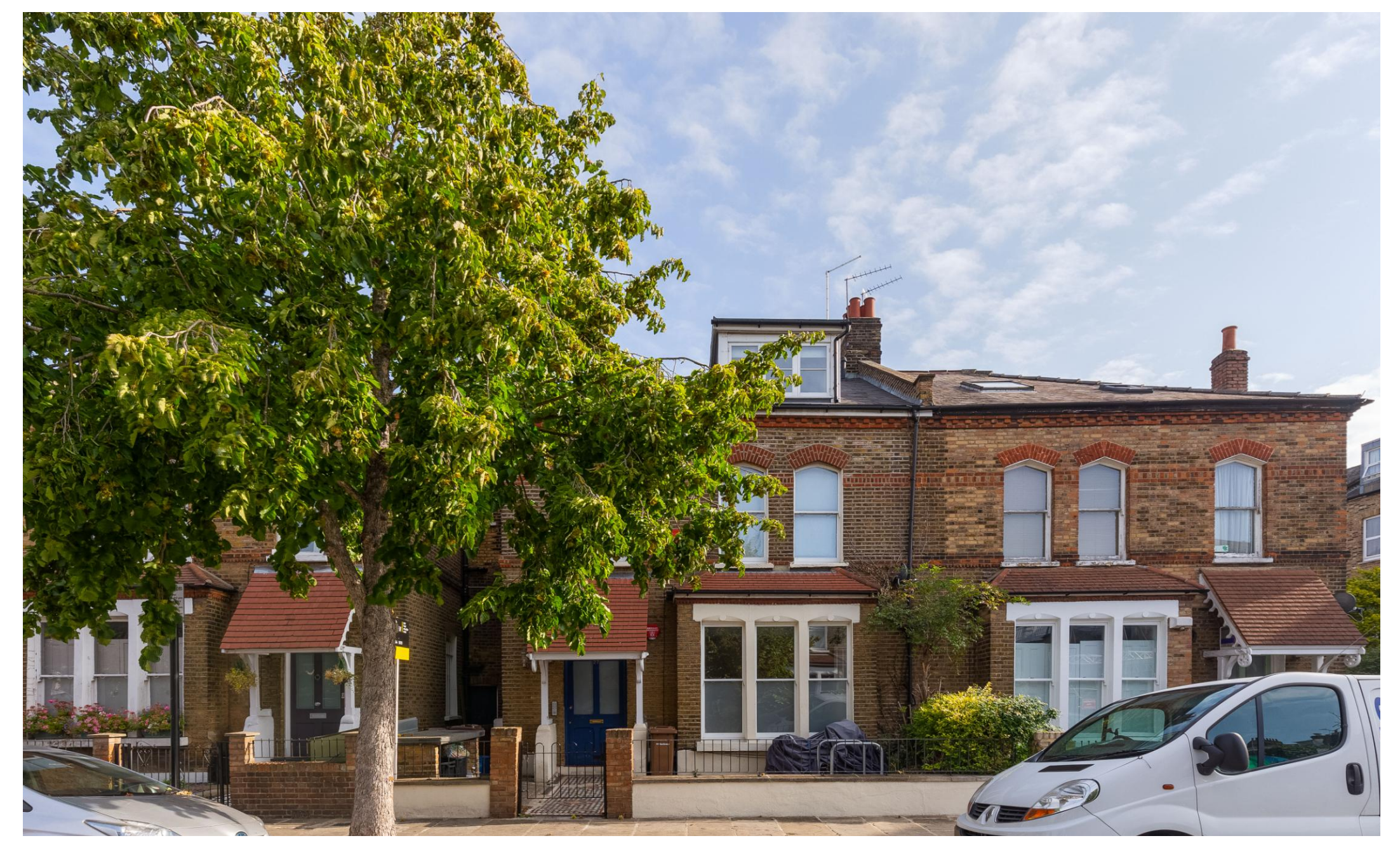
Finsbury Park Road, N4 2LA