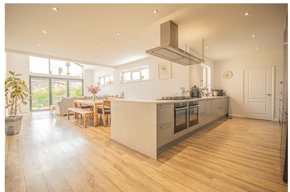
Carr Hill Road Upper Cumberworth, Huddersfield