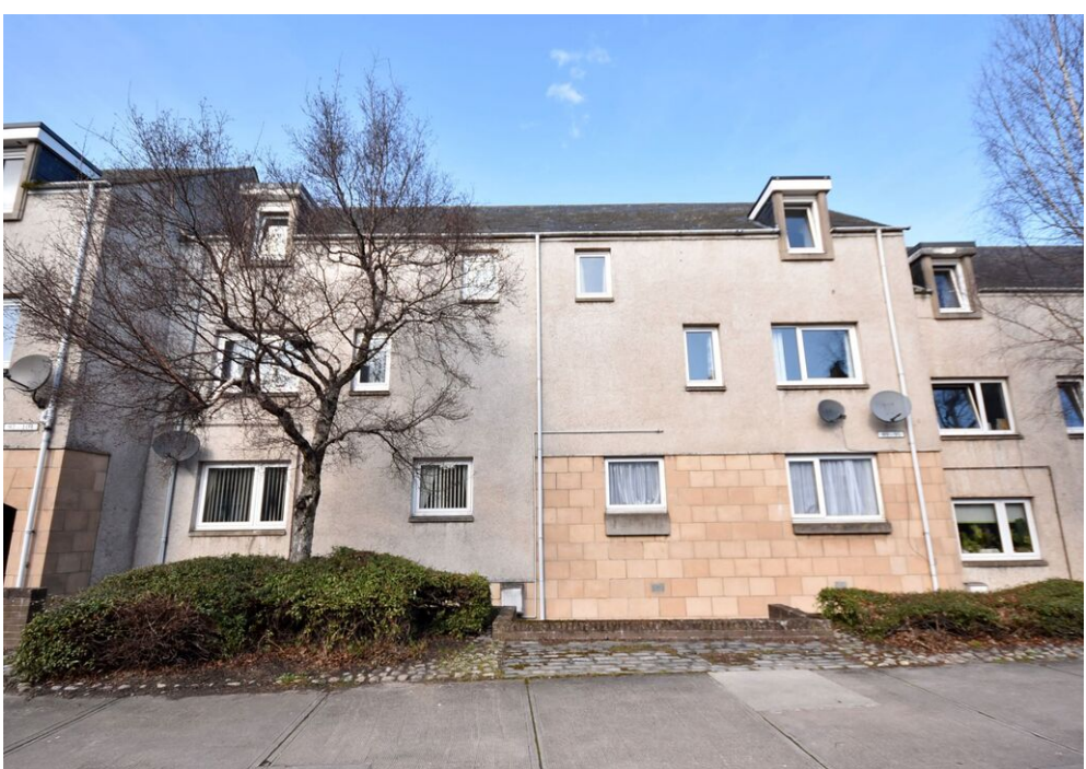
Offers Over £85,000

Located in the heart of Elgin, and walking distance to the high street and local amenities is this 1 Bedroom Ground Floor Flat.