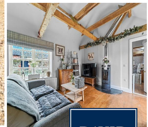
The Old Dairy, Honington, Bury St. Edmunds, Suffolk