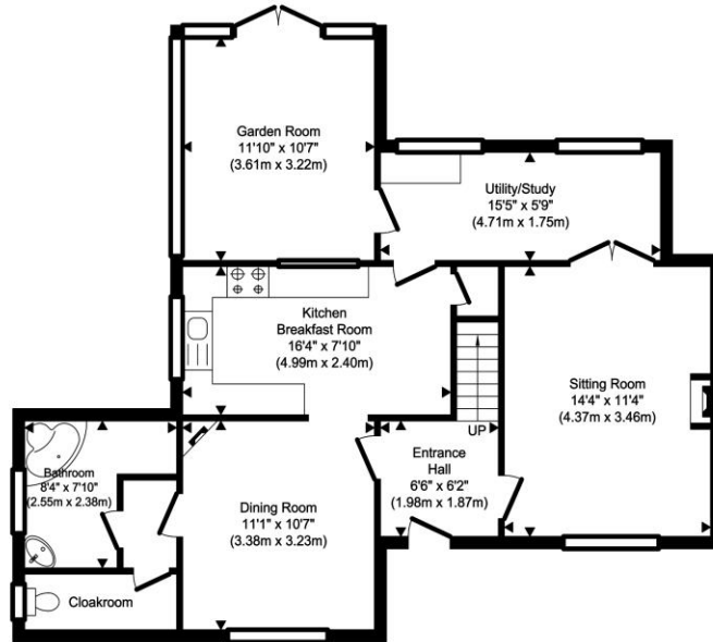
Ground Floor Approximate Floor Area 789.64 sq. ft. (73.36 sq. m)