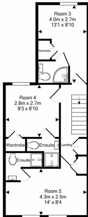
1st Floor Approx. Floor Area 41.7 Sq.M. (449 Sq.Ft.) Total Approx. Floor Area 83.9 Sq.M. (903 Sq.Ft.) Measurements are approximate. Not to scale. Illustrative purposes only Made with Metropix ©2018