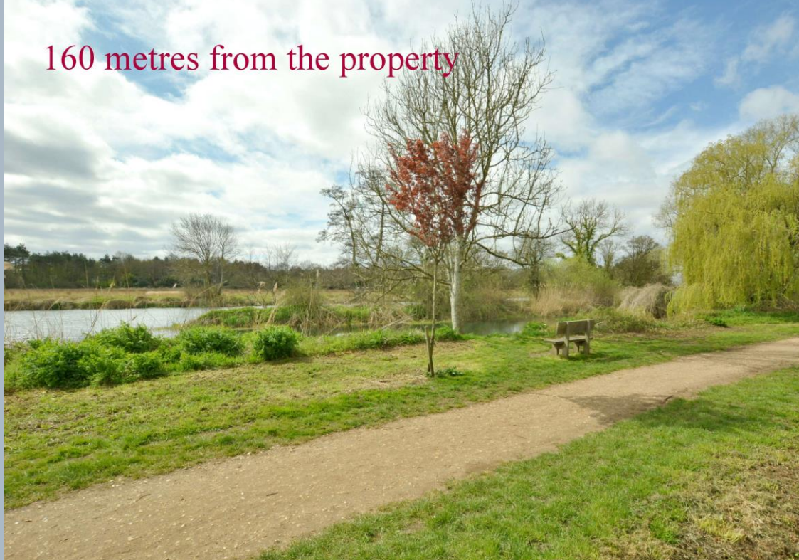
160 metres from the property