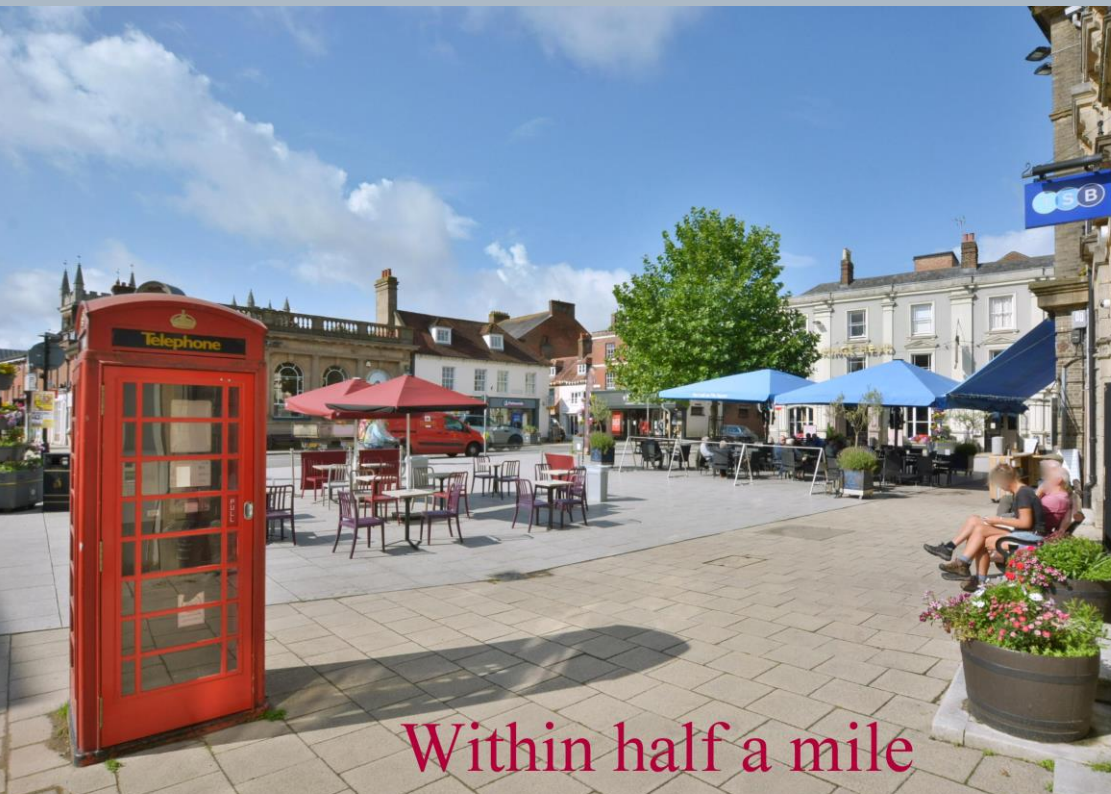
Within half a mile