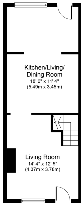
Ground Floor Approximate Floor Area 396 sq. ft. (36.8 sq. m.)