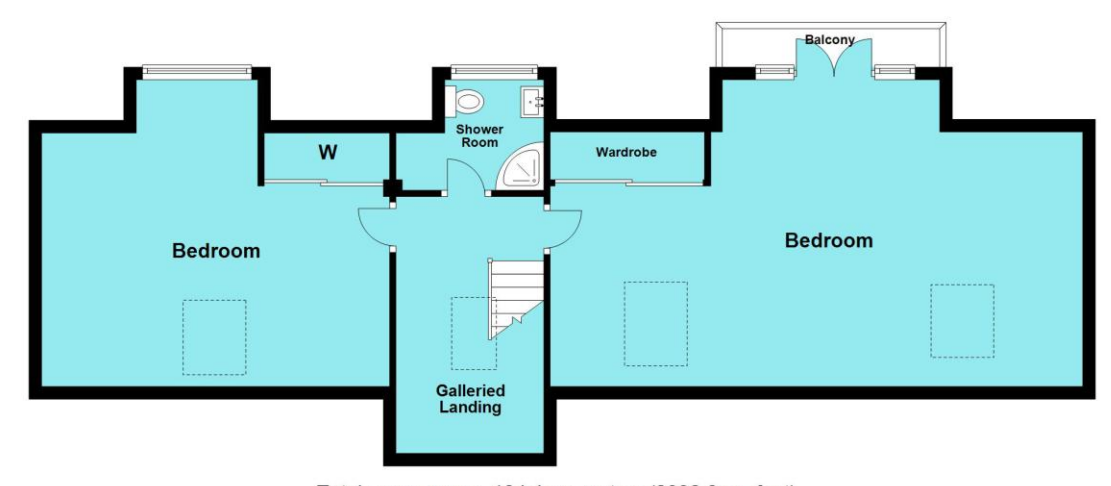
Total area: approx. 194.4 sq. metres (2092.6 sq. feet)

Whilst every attempt has been made to ensure the accuracy of the floor plan, measurements of doors, Windows, rooms and any other items are approximate and no responsibility is taken for error Omission or misstatement. This plan is for illustrative purposes only and should be used as such by any prospective purchaser. The services systems and appliances shown have not been tested and no guarantee as to their Operability or efficiency can be given Plan produced using PlanUp.