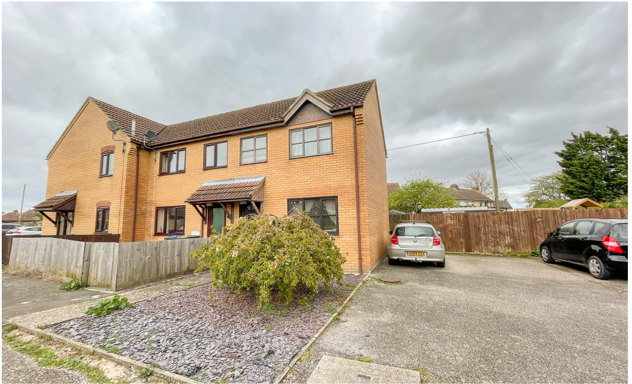
Orchard Row Soham