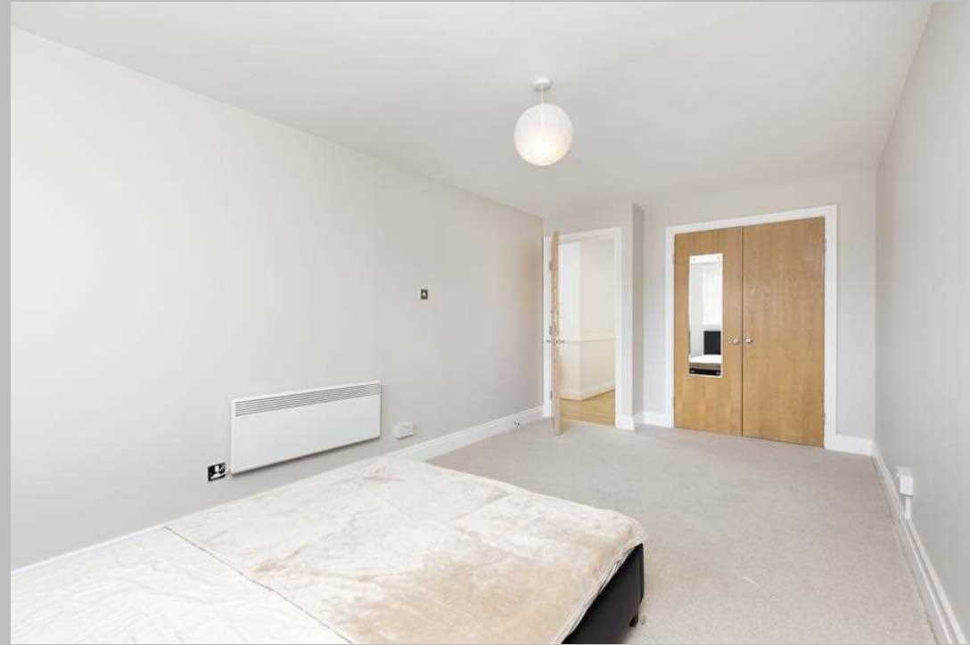
A stunning 6th floor apartment with direct river views