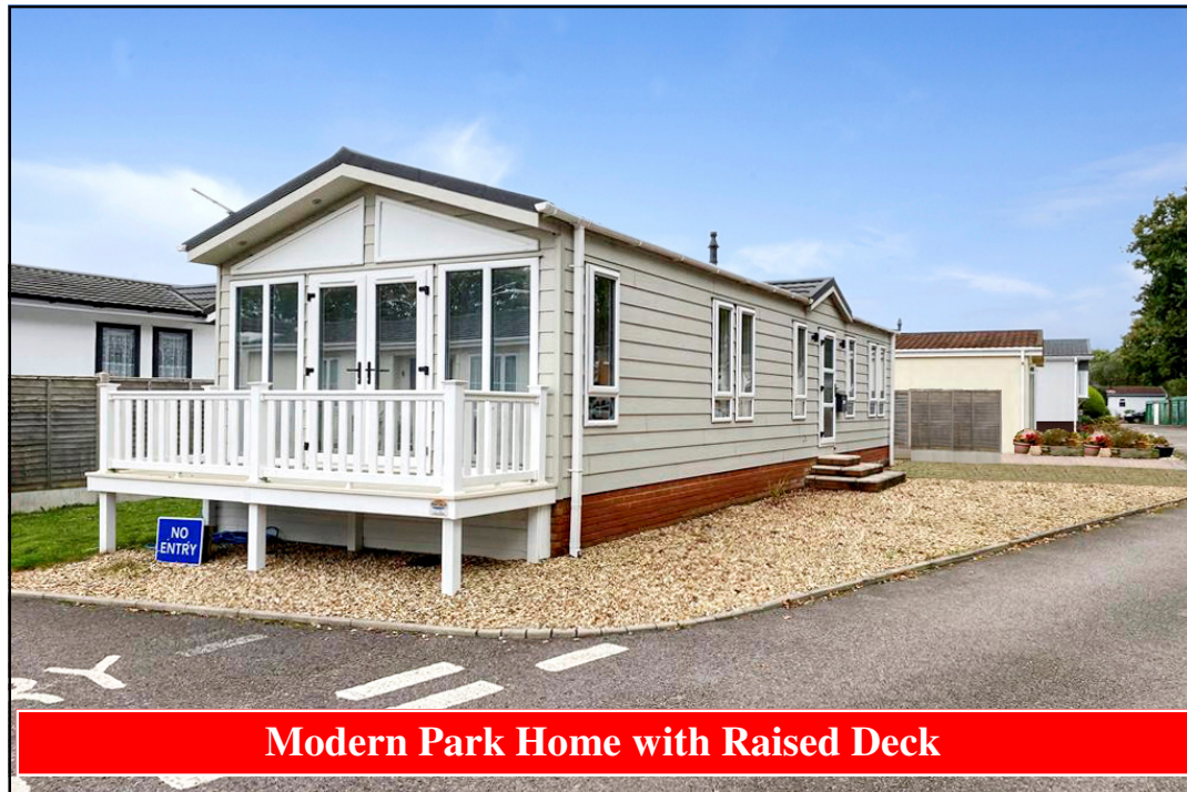
Modern Park Home with Raised Deck

44a Hillbury Park, Alderholt, Fordingbridge. SP6 3BW