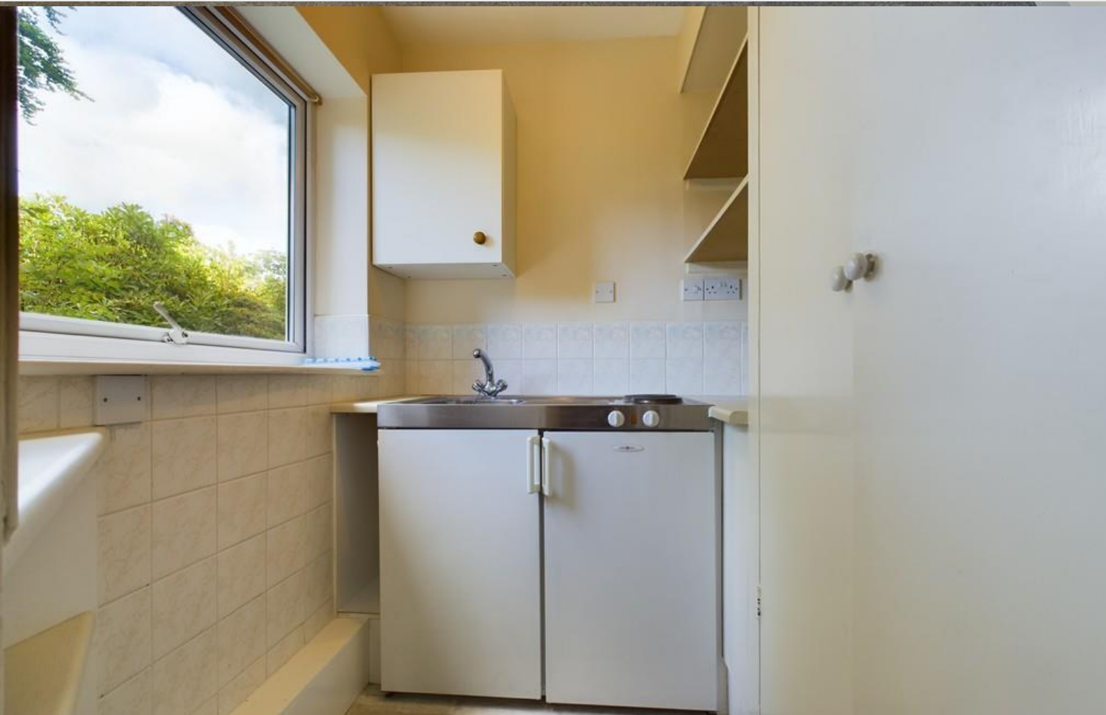
Typical Studio Kitchen