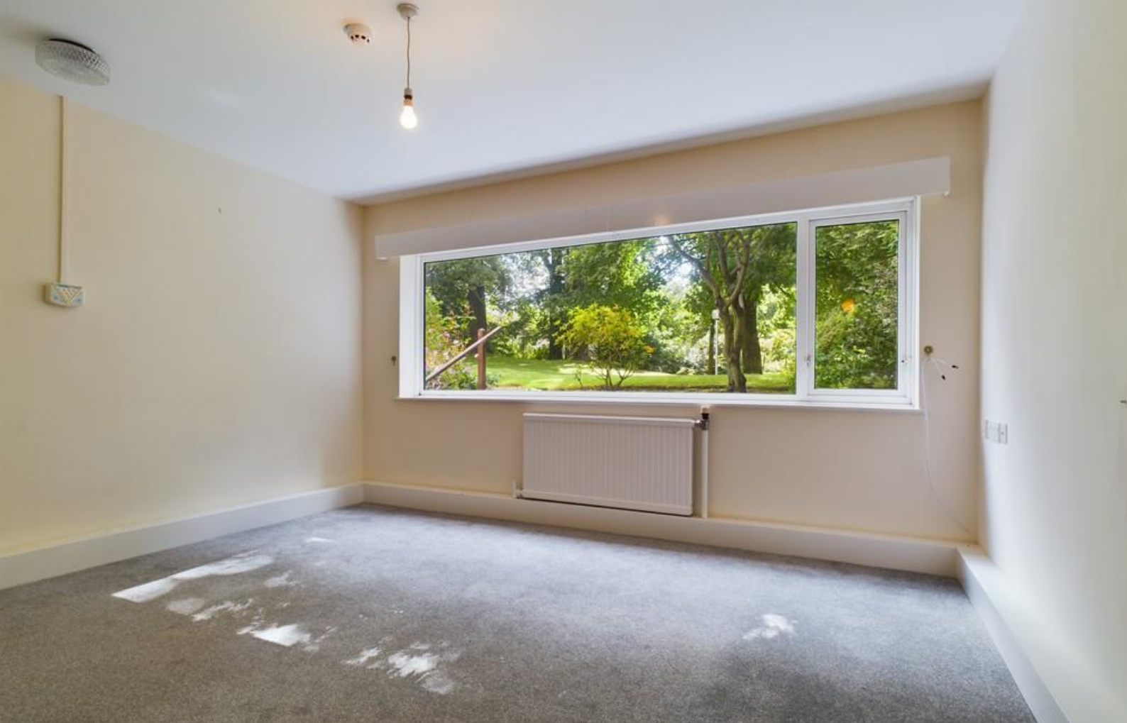
Typical Studio Living Area