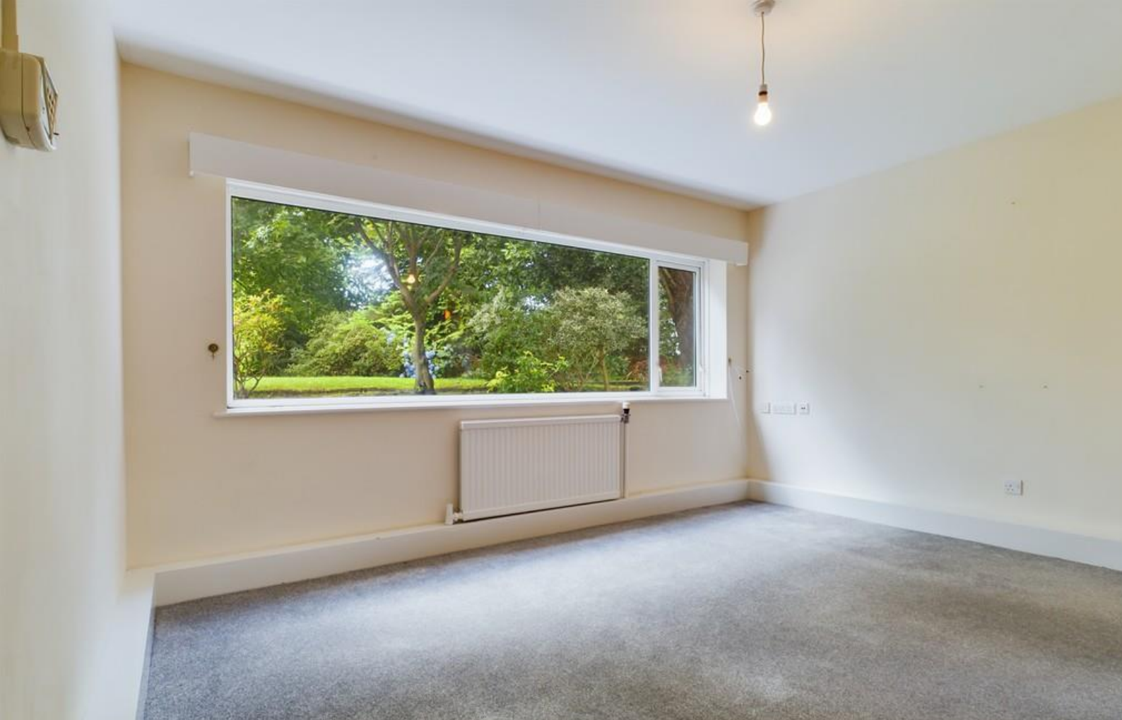
Typical Studio Living Area

Location: From Windermere follow the A5074 towards Ambleside Road. Turn left onto Ambleside Road and take the first left onto Phoenix Way. Nine Oaks can be found on the right-hand side.