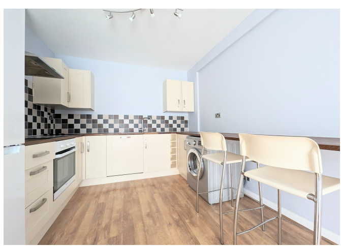
Offers Over £260,000