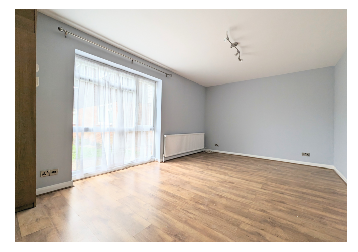
Wimblehurst Road Horsham, RH12 2AQ